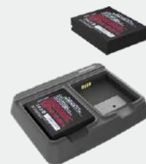
Dual-Slot Battery Charger